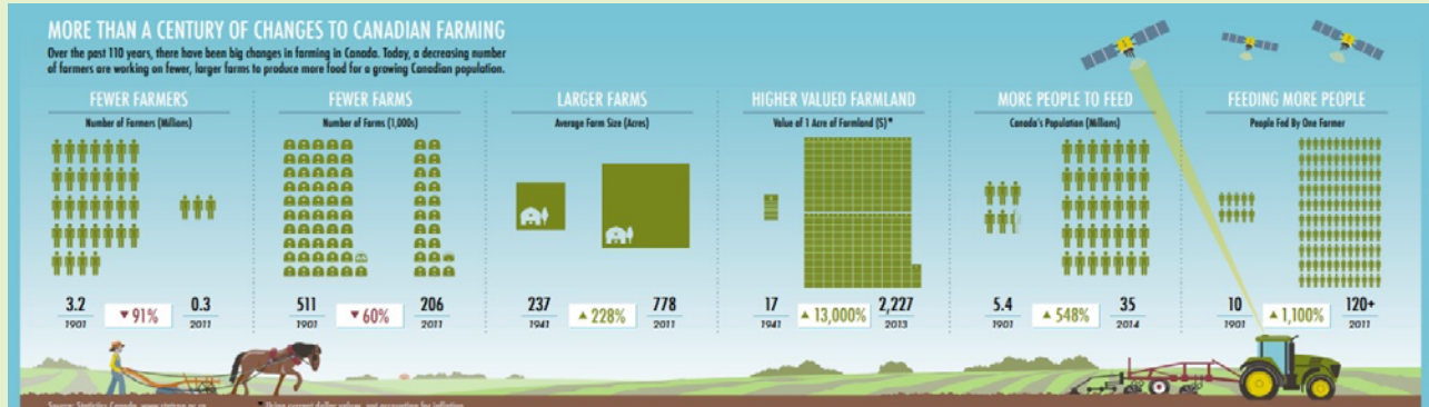
(Infographic from p. 2-3 of the 2016 Real Dirt on Farming )